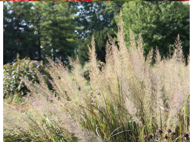
Right: Korean Feather Reed Grass