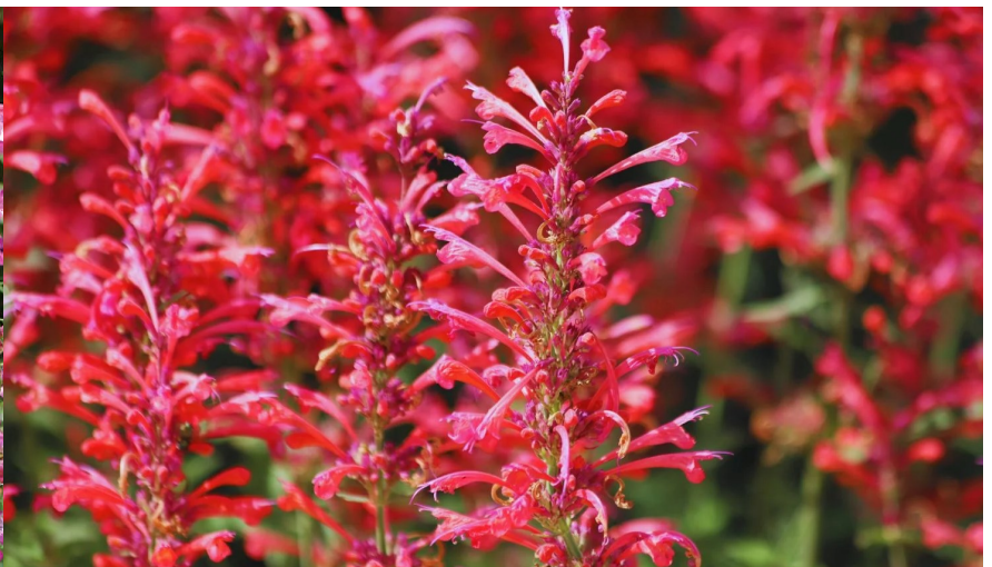
Left: Carolyn's Hope or Red Rocks Penstemon