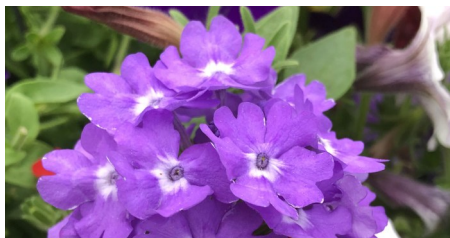
Verbena Superbena Violet Ice