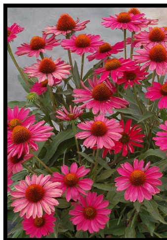
Raspberry Kismet Echinacea