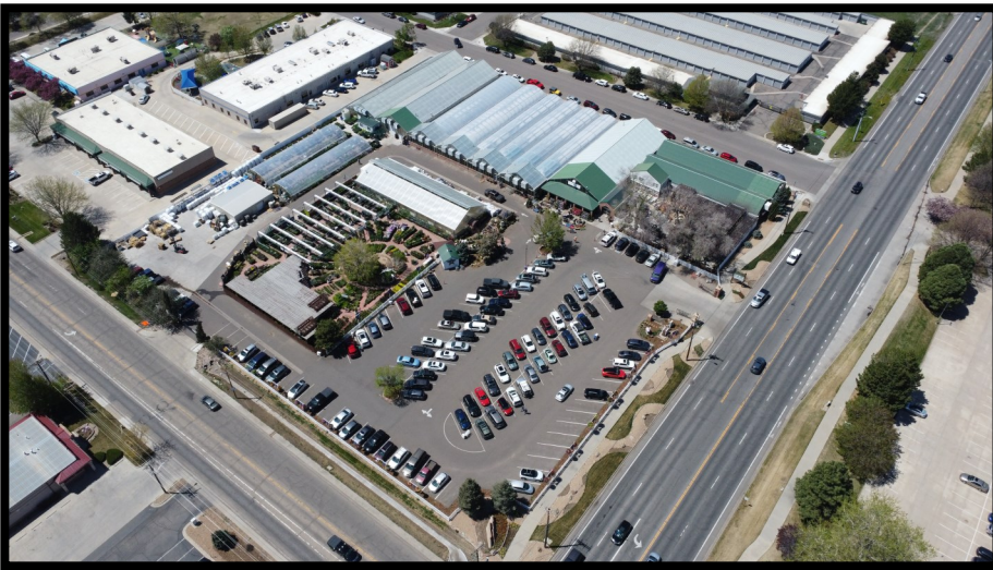
The Flower Bin

There are many trips from the growing range arriving daily to deliver Flower Bin Grown plants