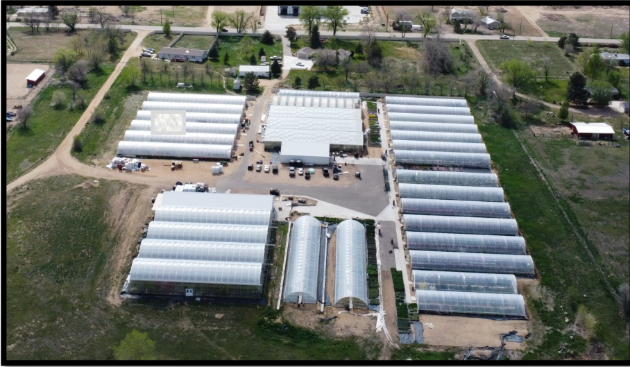
Flower Bin Growing Range