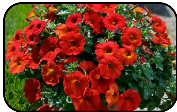
Petchoa Supercal Premium Red Maple