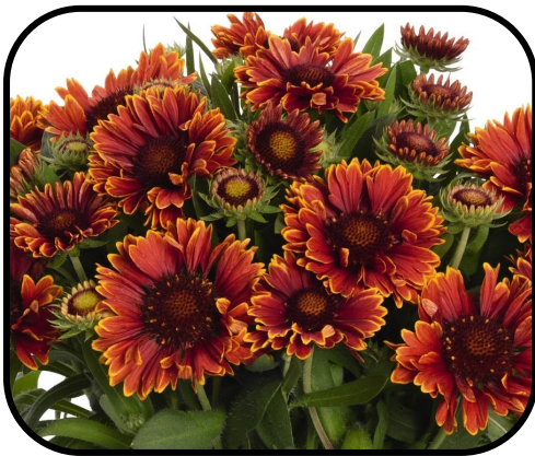
Gaillardia Spintop Orange Halo