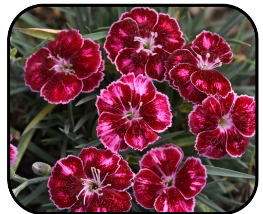
Dianthus Mt Frost Ruby Glitter