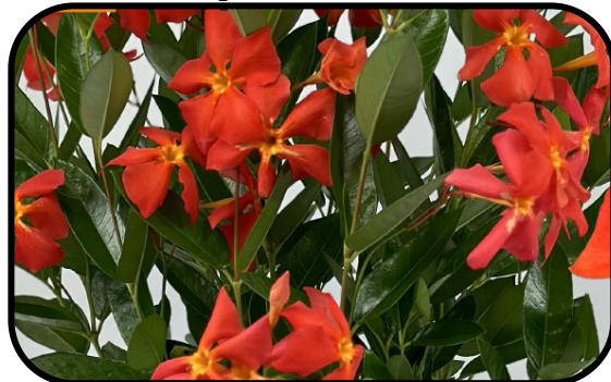
Mandevilla Fired-up Orange