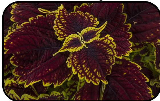
Coleus Talavera Moondust