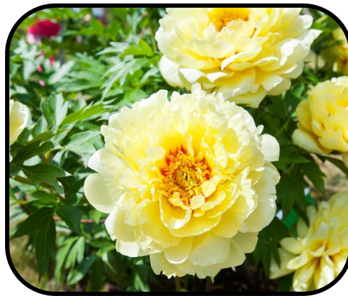
Itoh Peony Barzella