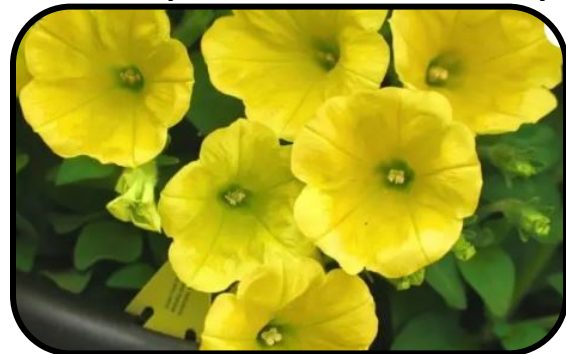
Petunia Surprise Yellowstone Forever