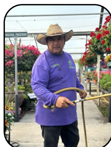
MANUAL Grower 28 Years