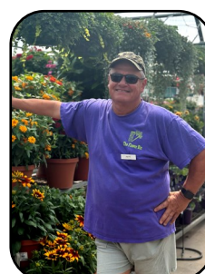
KEITH Annuals 3 Years