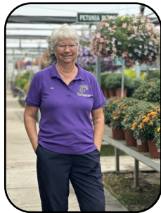
KIM Annual House Manager 14 Years