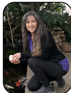
COLEEN Hard Goods 1 Year