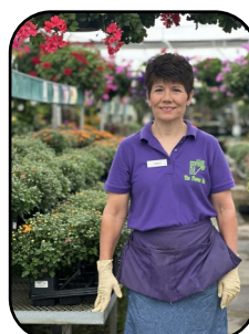
HOLLY Annuals 3 Years