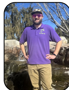
CODY Perennials 1 year