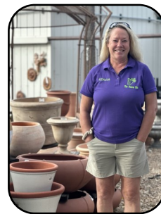
STACIA Court Yard 9 Years