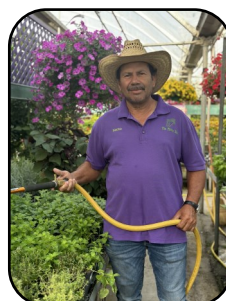
NACHO Grower 20 Years