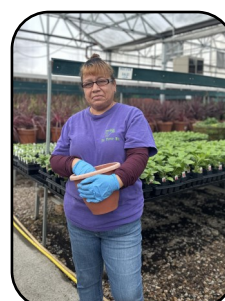
IRMA Annuals 14 Years