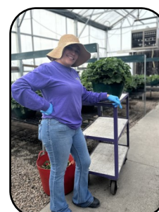
JUANA Annuals 1 Years