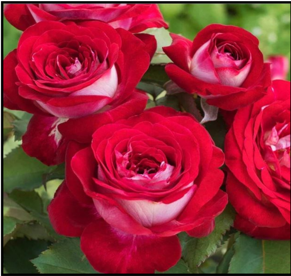
Love at First Sight