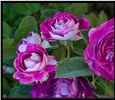
Cosmic Cloud, Shrub