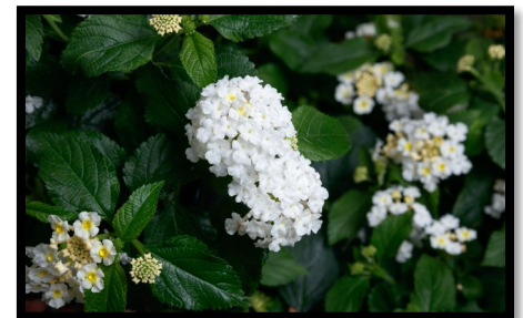
Lantana Sun Dance White