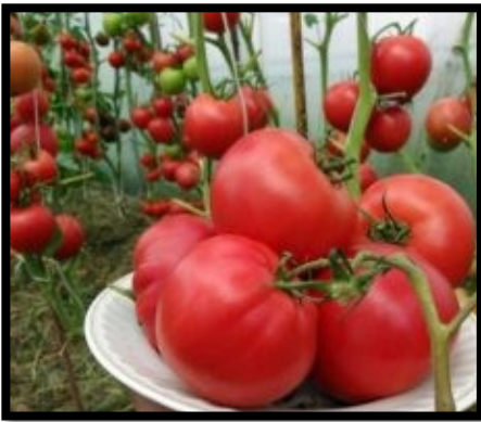
Solar Flare, Tomato