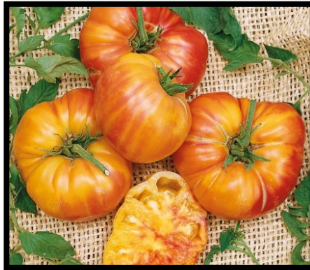
Buffalo Sun Tomato