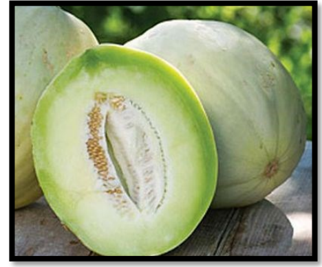
Dulce Nectar, Honeydew