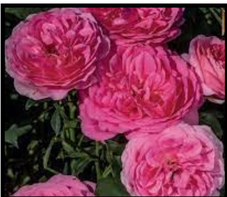
Miss Manners, Grandiflora