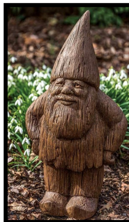
Ulrich Von Snootypants

With warm days right around the corner. Spring is the time of plans and projects.