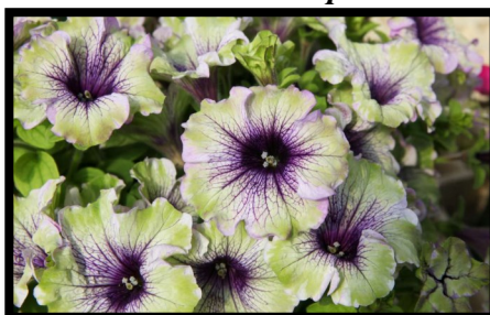
Petunia Amazonas Plum Cockatoo