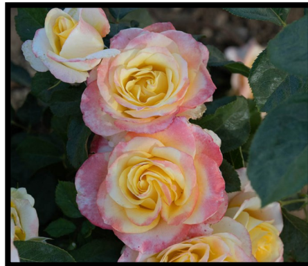
Make Me Blush, Hybrid Tea