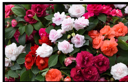
Double Impatiens Glimmer Series