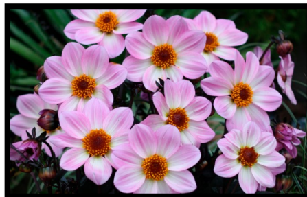
Dahlia Dahlgria Magenta Bicolor