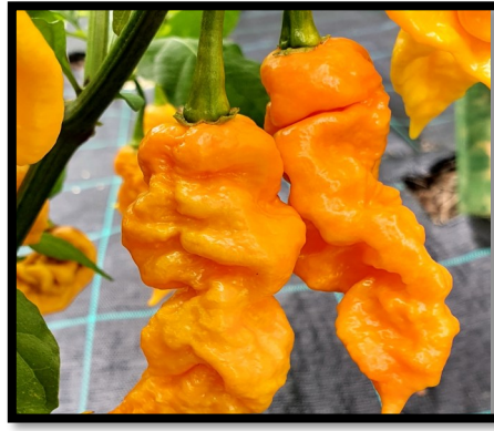
T-Rex Yellow, Pepper