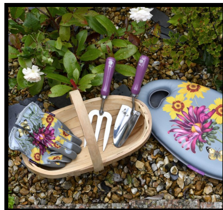
Matching Gloves, Kneeling Pads and Tools