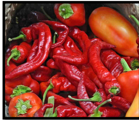
Jimmy Nardello, Pepper