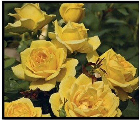
Quest for Zest, Grandiflora