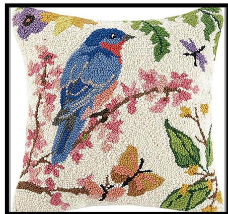
Colorful Hooked Pillows