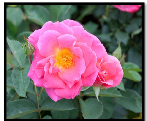
Pink Freedom, Shrub