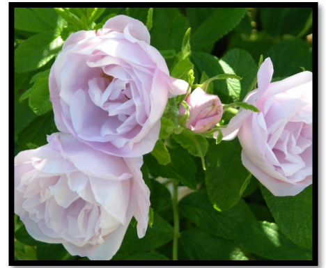
Snow Pavement, Rugosa