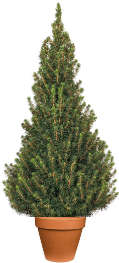
Dwarf Alberta Spruce

Fat Albert Spruce, Blue Hills Spruce, Weeping Norway Spruce, Dwarf Albert Spruce, Silver Whispers Swiss Stone Pine, Eastern White Pine, Atrovirens Oriental Spruce, Baby Blue Eyes Spruce, Bruns Serbian Spruce, Colorado Blue Spruce