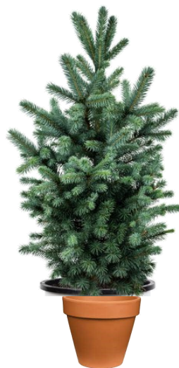
Colorado Blue Spruce

Besides Poinsettias, These are traditional flowers for the Holidays