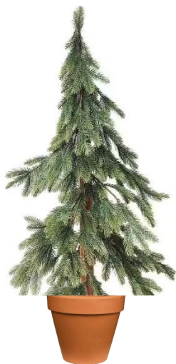
Weeping Norway Spruce