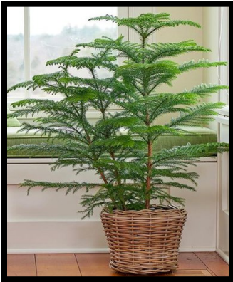
Norfolk Island Pine