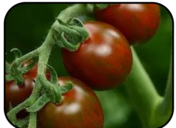
Tomato -Chocolate Sprinkles