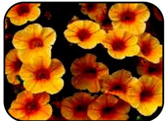
Calibrachoa - Calitastic Caramel