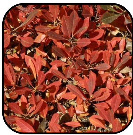
Pawnee Buttes Sandcherry