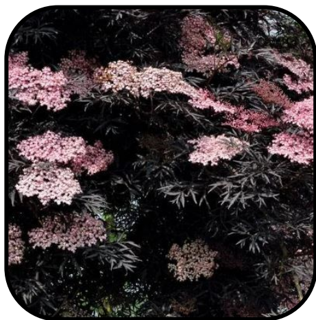
Black Lace Elderberries