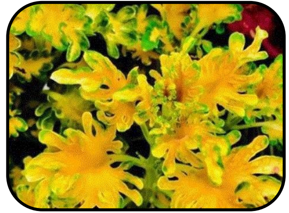
Coleus - Gold Guppy