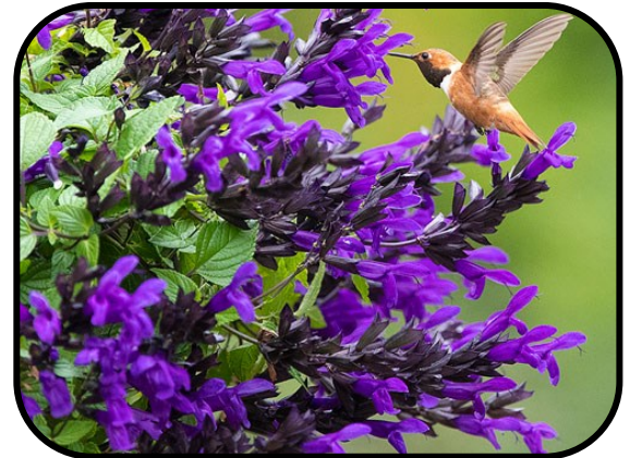
Salvia - Hummingbird Falls