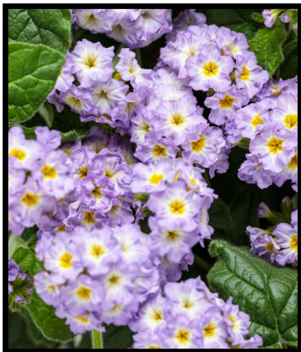
Heliotrope Augusta Lavender