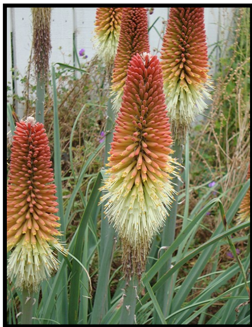
Regal Torch Lily