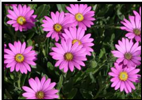
Purple Mountain Sun Daisy