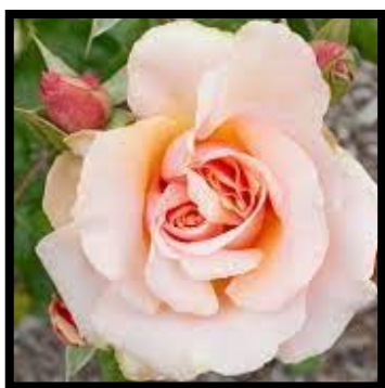
Mother of Pearl