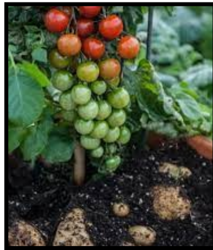
Ketchup & Fries