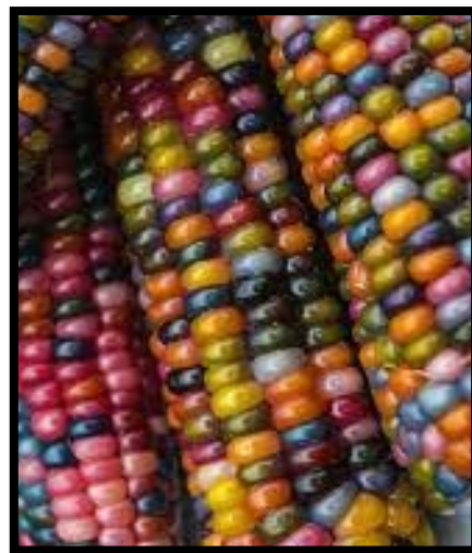
Corn Glass Gem