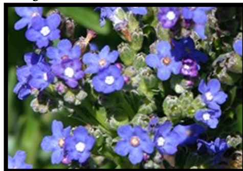
Cape Cod Forget Me Knot