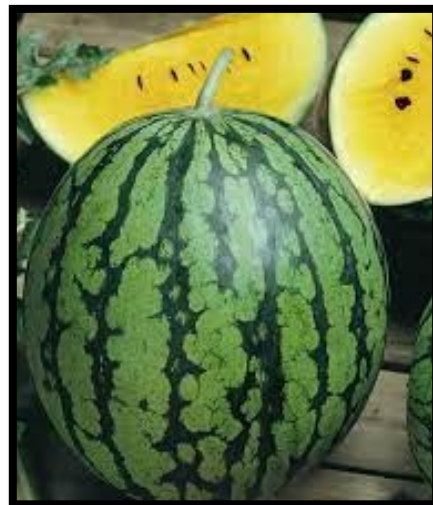
Watermelon Yellow Doll